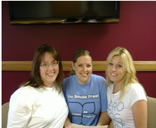
MSSU PASS members at the Joplin City Council Meeting